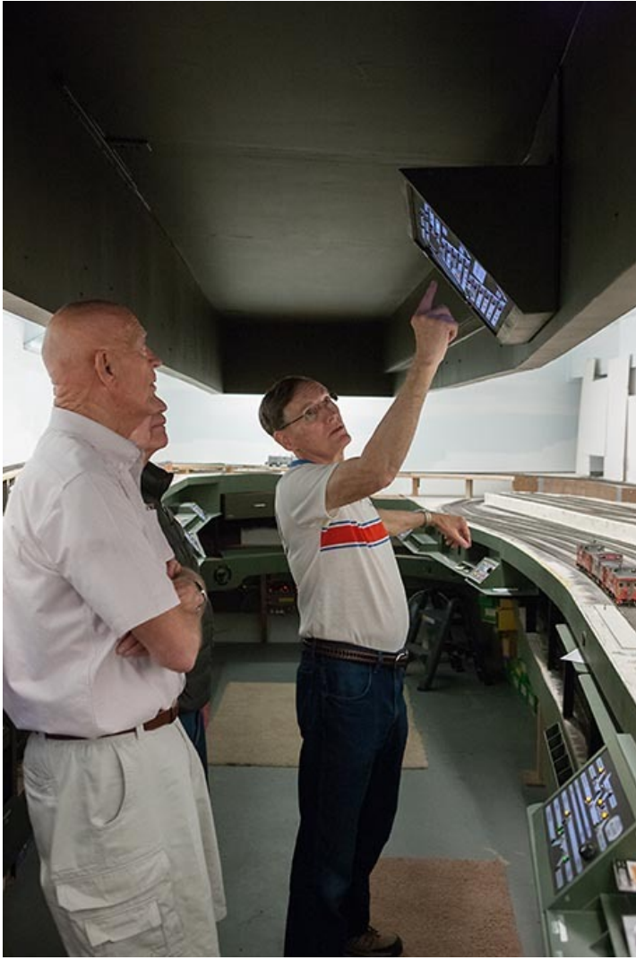
The hump yard bowl was filling up and soon ready for demonstration.