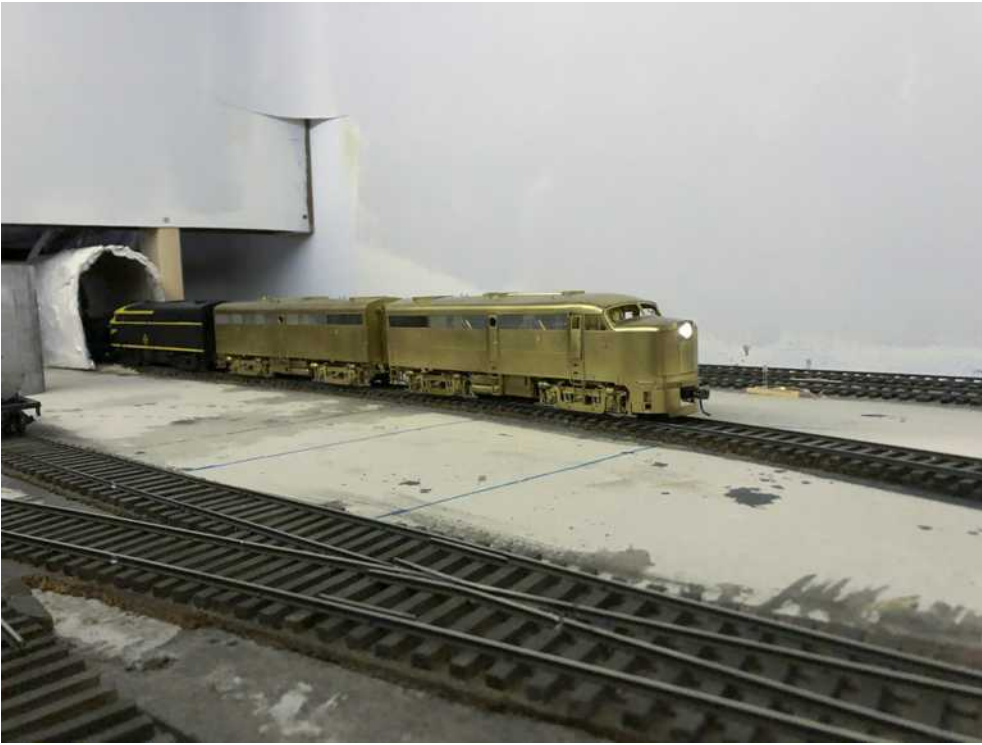
An Alco FA-1 leads a string of empty hoppers into Linnwood.