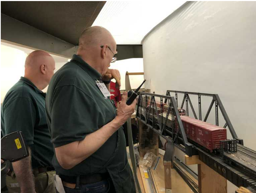
Meet at Union Gap.