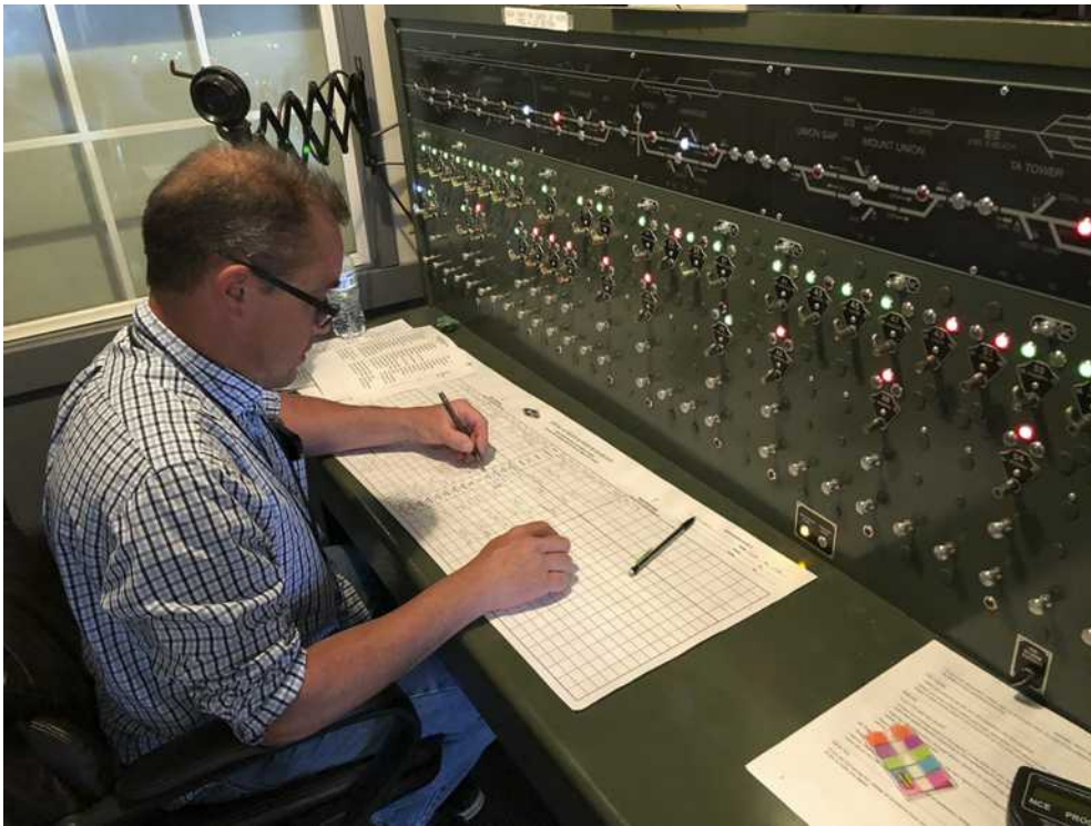
No job is complete until the paperwork is done. We do it prototypically. We don't need no steenkin' magnets!