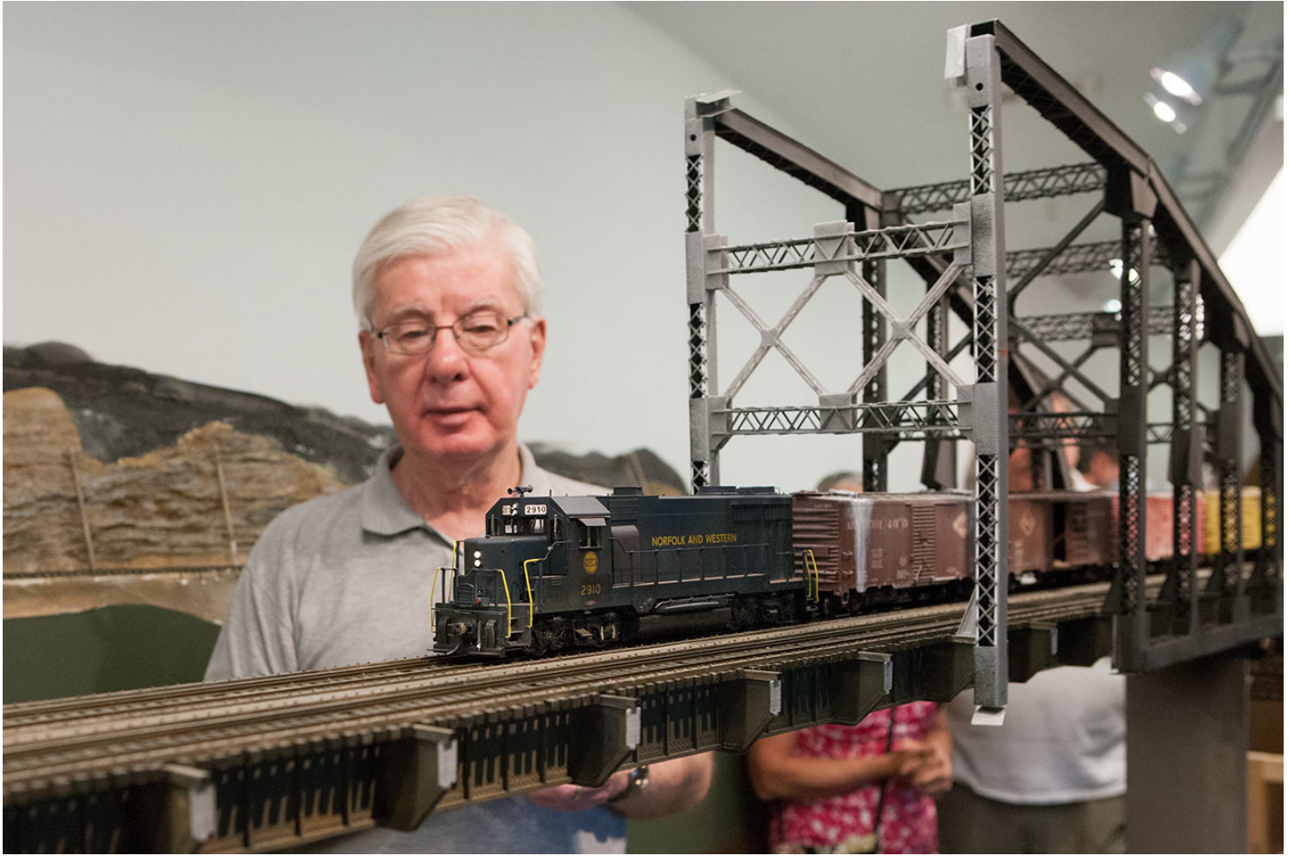
Two happy modelers with 2910 at CP Jay.